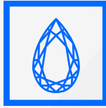
Irregular Gem Stones